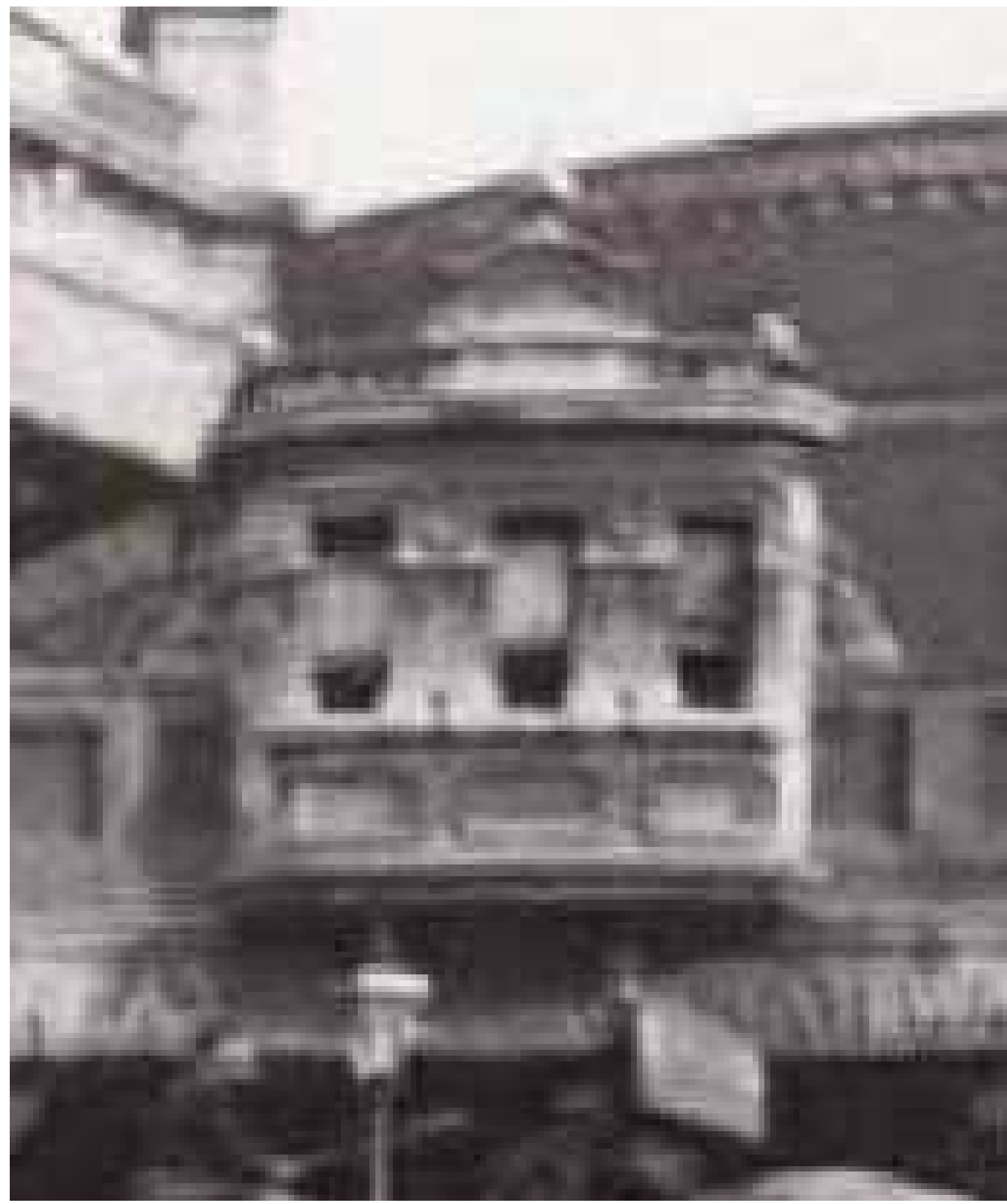
Archive Photo Oriel Structure view from Shoreditch Highstreet (circa 1924)

NOTE: REFER TO SPACE HUB DRAWINGS FOR SITE- WIDE LEVELS, PUBLIC REALM & LANDSCAPING REFER TO PLOVERMAN CRAVEN SURVEY DRAWINGS: 15532-0108-04 (A) - Oriel Drawings FOR DETAIL OF LISTED STRUCTURES REFER TO: KMH HERITAGE STATEMENT & ALAN BAXTER CONDITION SURVEY