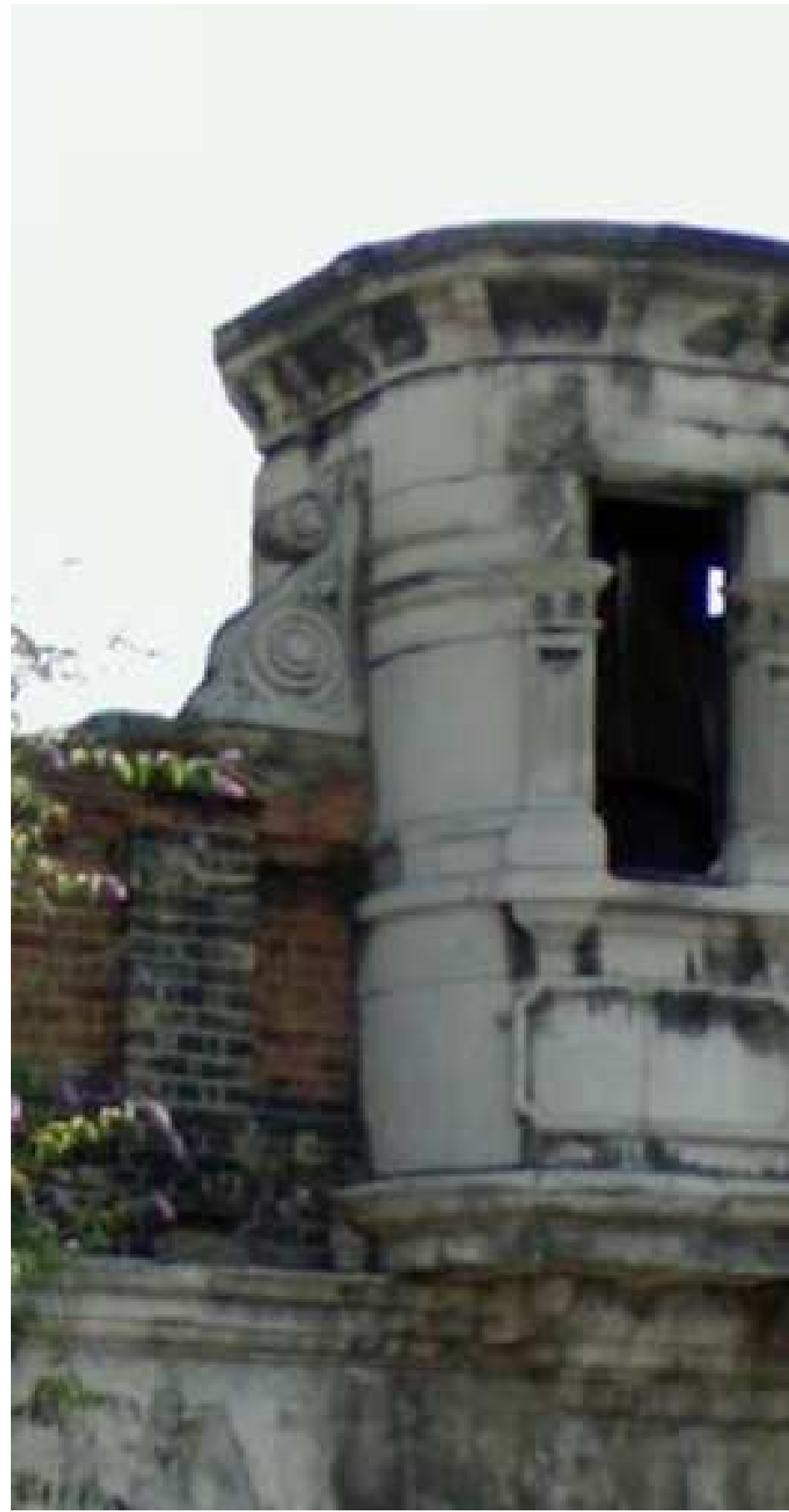
Existing Photos Views of Oriel Structure from Shoreditch Highstreet